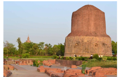
Dhamek Stupa, Sarnath