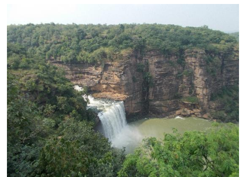
Waterfall in Chandraprabha Wildlife Sanctuary