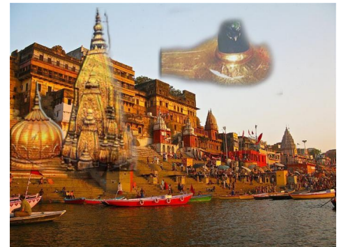
Kashi Vishwanath Temple