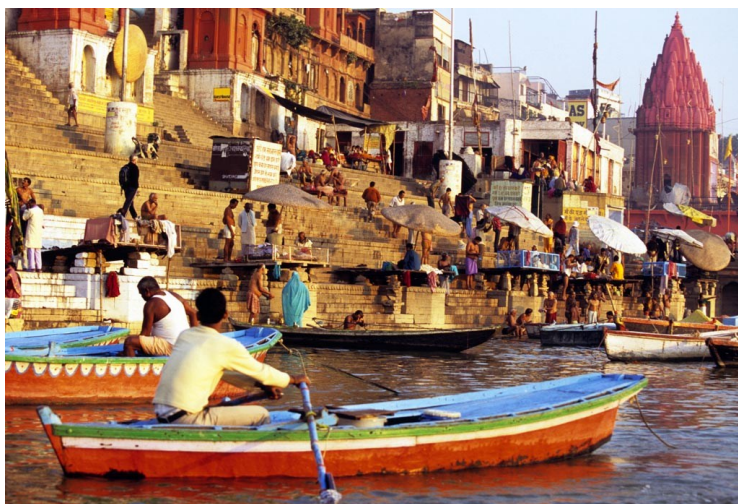
Offering on the Ganges, Varanasi

The well-known Buddhist site of Sarnath, which has long been a place for religious pilgrimage, is at a distance of 10 kms from Varanasi. Buddha delivered his first sermon after getting enlightenment about 2500 years ago at Sarnath. Chunar, 40 kms away from Varanasi, has an immense fort overlooking the Ganga. The fort has a sun dial and a huge wall, and provides a splendid view of the Ganga. Chandraprabha Wildlife Sanctuary, 70 kms from Varanasi, is a beautiful spot for picnics. Kaimoor Wildlife Sanctuary, 130 kms away from Varanasi, has a variety of wildlife. The Mukha waterfall in the sanctuary is a popular attraction.