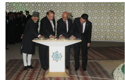
Leaders press the button to begin the welding process of TAPI Gas pipeline

Vice President Mr. Ansari visited Mari on 13th December. He addressed the groundbreaking ceremony of the Turkmenistan-Afghanistan-Pakistan-India (TAPI) Gas Pipeline Project in presence of President of Turkmenistan Mr. Gurbanguly Berdimuhamedow, President of Afghanistan Mr. Ashraf Ghani and Prime Minister of Pakistan Mr. Nawaz Sharif. He said that the launch of the project marks the first step towards fulfilling the vision of an economically integrated region stretching from the Bay of Bengal to the Caspian Sea. He emphasized that the TAPI project is a reflection of the common desire of the four member countries to re-connect and a way to re-claim the shared geography and revitalize an age-old legacy of mutually enriching interactions.