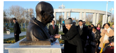
Vice President pays respects at the statue of Mahatma Gandhi

Vice President Mr. Ansari addressed the international neutrality conference attended by a number of leaders and dignitaries on 12th December. He said that the policy of neutrality is that of peace, non-violence and peaceful resolution of disputes. He mentioned that the formal proclamation of neutral status was a historic event for Turkmenistan and it set the stage to chart out its path for development and progress on its own terms while respecting the fundamental principles of international peace and cooperation. He added that this wise yet pragmatic vision guided the nation to transform into a fast growing economy marked by political stability.