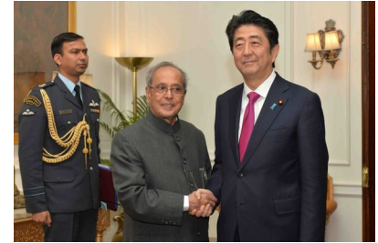
Japanese PM calls on President

Prime Minister Modi announced that for the first time, India would export to Japan cars made domestically by Maruti Suzuki under the 'Make in India' initiative. Prime Minister Abe along with Prime Minister Modi visited Varanasi. They performed Ganga Aarti, an Agni Pooja (worship to fire) dedicated to Lord Shiva at Dashashwamedh Ghat in Varanasi on the banks of river Ganga.