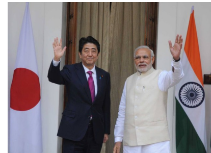
Prime Minister Abe meets Prime Minister Modi