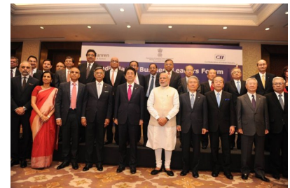
India-Japan Business Leaders Forum