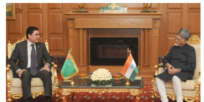
Vice President calls on President of Turkmenistan

Vice President of India Mr. Mohammad Hamid Ansari visited Turkmenistan from December 11-13, 2015 to attend the events relating to 20th anniversary of the permanent neutrality of Turkmenistan in Ashgabat and groundbreaking ceremony of TAPI Gas Pipeline Project in Mari. He called on President of Turkmenistan Mr. Gurbanguly Berdimuhamedow on 11th December. President Berdimuhamedow said that they were looking forward to moving on the TAPI project as quickly as possible. Vice President Mr. Ansari mentioned that TAPI is not just a pipeline but a regional connectivity initiative. The leaders touched upon the possibilities of cooperation in fertilizers, particularly in the production and the long-term uptake of urea.